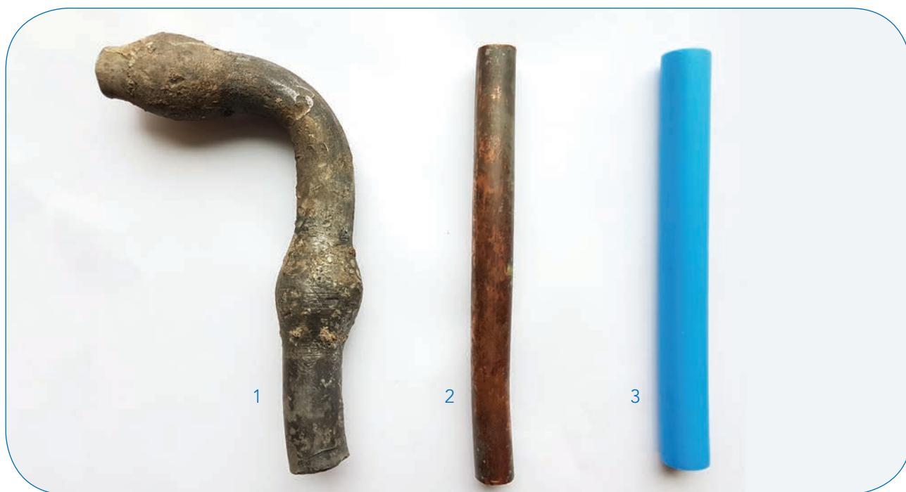
1. Lead 2. Copper 3. MDPE (Medium-density polyethylene)

Examples of supply pipes made from different materials. Lead pipe has a swollen joints compared to the others.