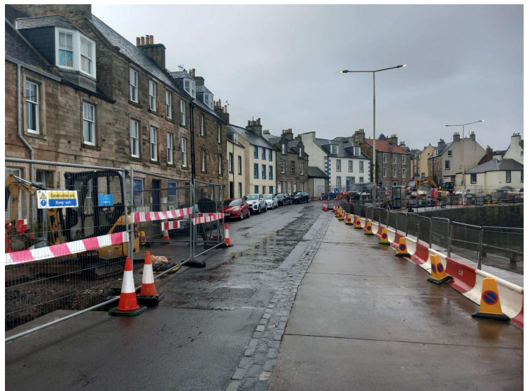
Image: Ongoing East Shore Works

Traffic Management: The current traffic management is set up to ensure we maintain vehicle access through East Shore along to Mid and West Shore. Please help us to maintain this by adhering to the current parking restrictions that are in place.